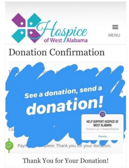
Paying it forward