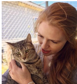
Adopting new family members