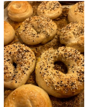
Baking endeavors