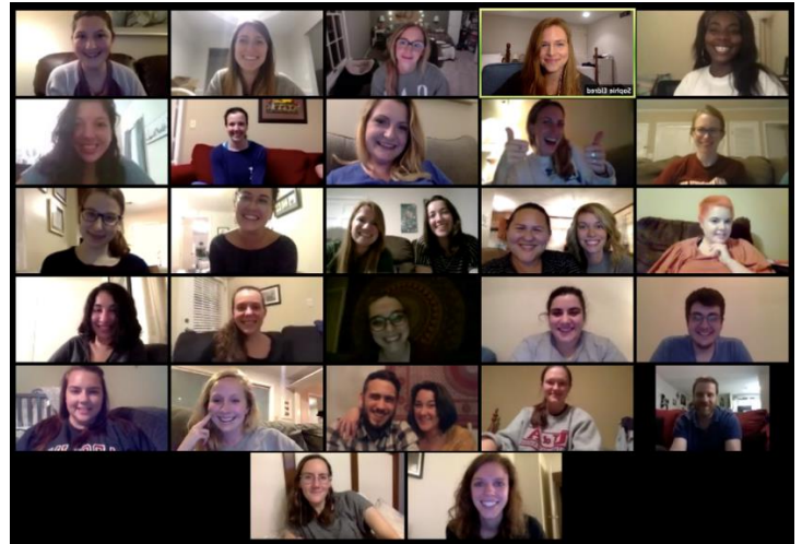
PGSA Sponsored Zoom Trivia

What have students been up to in isolation you ask?