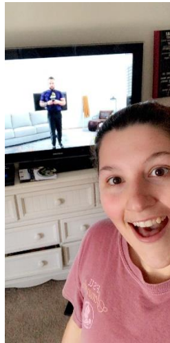
At-home workouts